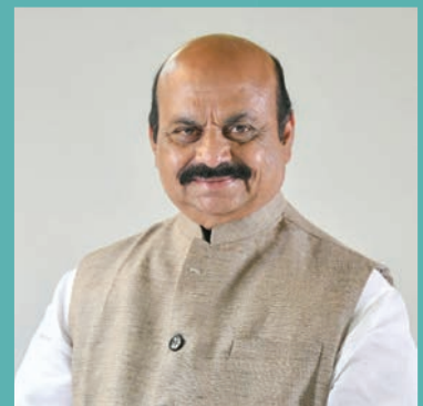
Chief Guest Honourable Chief Minister Shri. Basavaraj Bommai Govt. of Karnataka